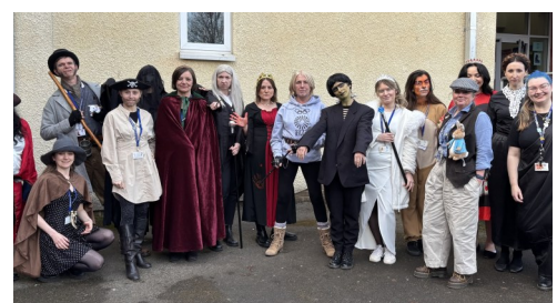
Gordano Secondary School