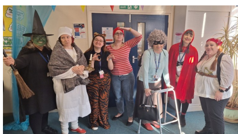
Gordano Secondary School