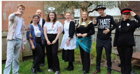
Churchill Academy & Sixth Form