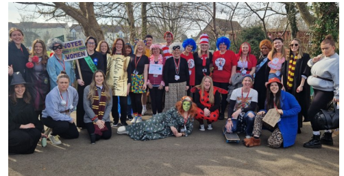
St Peters CE Primary School