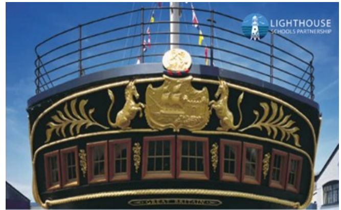
The History Curriculum at Lighthouse Schools Partnership